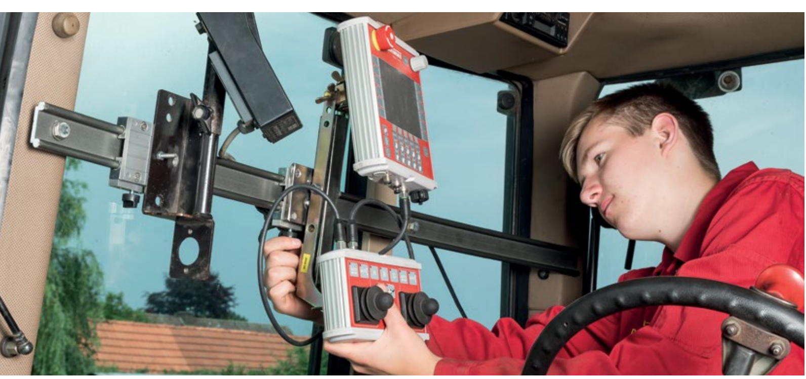
The rail allows operators to conveniently position screens and control boxes, and then simply slide them out of the way when they're not in use.

prayers and root harvesting equipment are probably the worst offenders for cluttering up cabs, as there is usually an implement control box, a GPS display and then a couple of camera screens in there for good measure. Finding room for everything can prove tricky, particularly if juggling between other machines and the terminals are left in place. It would be nice to just slide them out of the way when not needed – to allow some daylight back into the cab.